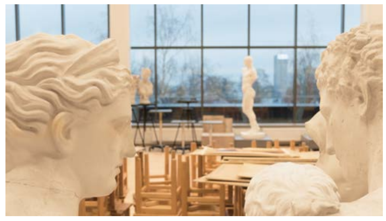
Drawing Room at the RTU Faculty of Architecture and Urban Planning